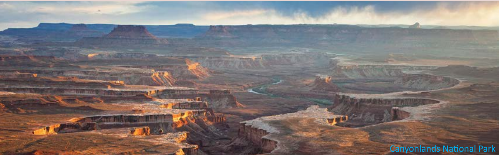
Canyonlands National Park