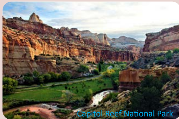
Capitol Reef National Park