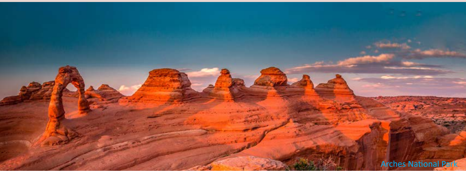
Arches National Park