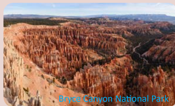
Bryce Canyon National Park